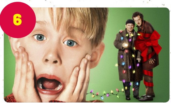
Answers on page 3 (don't peek)

EIF TM and © MMIII New Line Productions Inc. All Rights Reserved Home Alone © 1990 Twentleth Century Fox Film Corporation. All Rights Reserved. Last Christmas A Universal Picture © 2019 Universal Studios Love Actually A Universal Release © 2003 Universal Studios The Holiday © 2006 Columbia Pictures Industries Inc. All Rights Reserved The Holiday © 2006 Columbia Pictures Industries Inc. All Rights Reserved © Snowman Enterprises Ltd. 1982