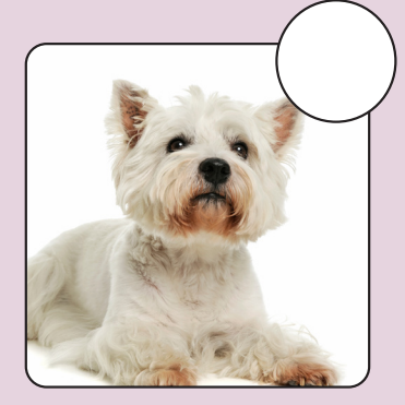
WEST HIGHLAND TERRIER