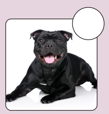
STAFFORDSHIRE BULL TERRIER